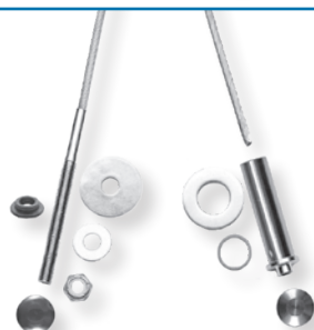
102 Series Kit